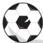
la educación física